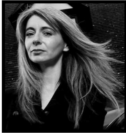
Dame Evelyn Glennie